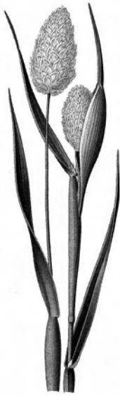
Canary grass ( Phalaris canariensis )

light. But no one knew at that time how or which part of a plant sees the light coming from a particular direction.