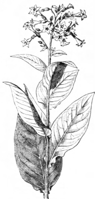
Tobacco ( Nicotiana tabacum )

light the plants saw was enough to cause Maryland Mammoth to stop growing and start flowering. In other words, if Maryland Mammoth was exposed to the long days of summer, it would keep growing leaves. But if it experienced artificially shorter days, then it would flower.